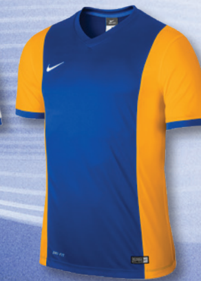
467 Royal Blue/University Gold/ Royal Blue/(White)