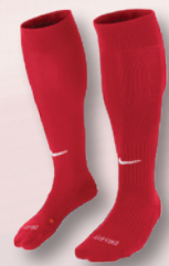
648 University Red/ (White)