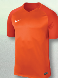
815 Safety Orange/Team Orange/ Team Orange/(White)