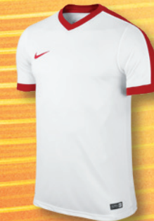
101 White/White/University Red/ (University Red)