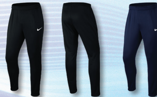
010 010 451 Black/(White) Backview Obsidian/(White)

Life-cycle: 01 April 2016 - 31 March 2019