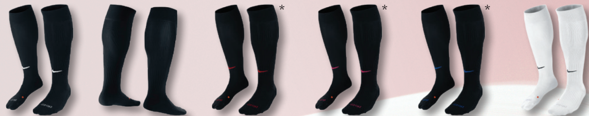
010 Black/ (White)