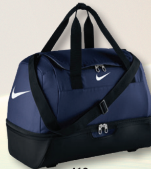
410 Midnight Navy/Black/(White)