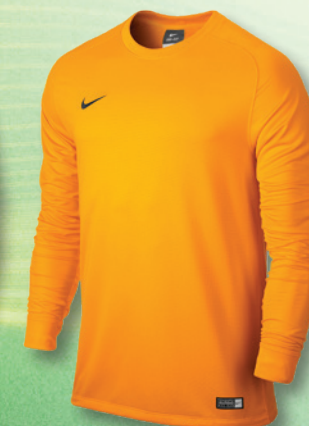
739 University Gold/(Black)