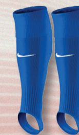
463 Royal Blue/(White)