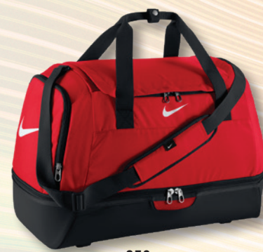
658 University Red/Black/(White)