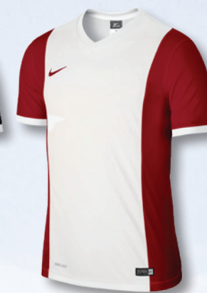
106 White/University Red/White/ (University Red)