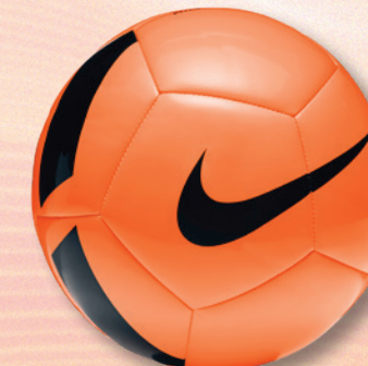
803 Total Orange/(Black)