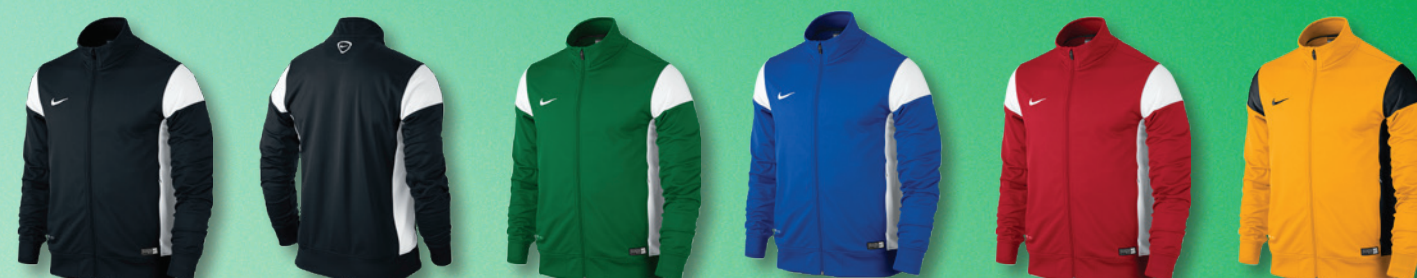
010 Black/White/(White) 010 Backview 302 Pine Green/White/(White) 463 Royal Blue/White/(White) 657 University Red/White/(White) 739 University Gold/Black/(Black)

Life-cycle: 01 April 2014 - 31 March 2018