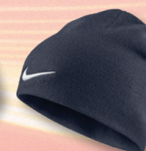
451 Obsidian/ (Football White)