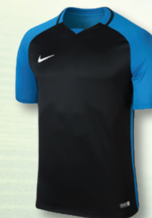
411 Midnight Navy/Lt Photo Blue/ Lt Photo Blue/(White)