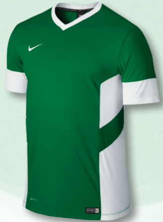
TRAINING TOP p.46