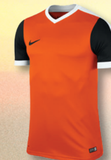
815 Safety Orange/Black/ White/(Black)