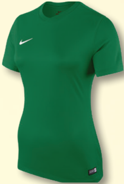
302 Pine Green/(White)