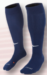
411 Midnight Navy/ (White)