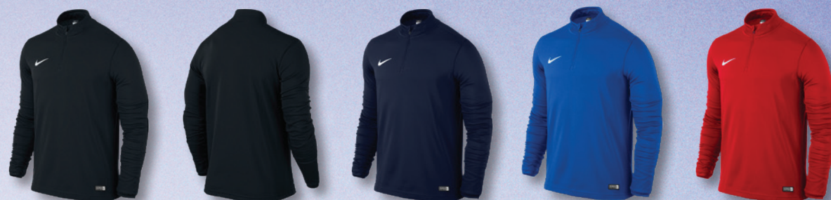
010 010 451 463 657 Black/(White) Backview Obsidian/(White) Royal Blue/(White) University Red/(White)

Life-cycle: 01 April 2016 - 31 March 2019