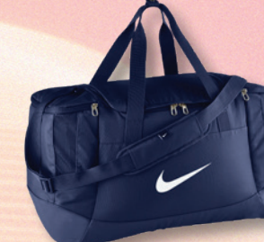
410 Midnight Navy/Midnight Navy/(White)