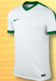
102 White/White/Pine Green/ (Pine Green)