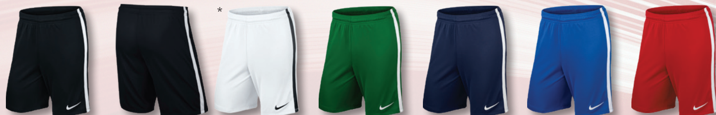
010 Black/White/ (White)

Life-cycle: 01 April 2016 - 31 March 2018