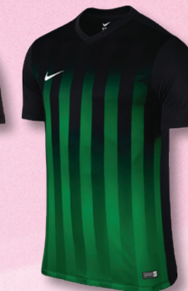
013 Black/Pine Green/ (White)