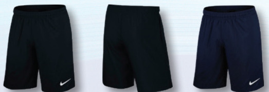
010 010 451 Black/(White) Backview Obsidian/(White)

Life-cycle: 01 April 2016 - 31 March 2019