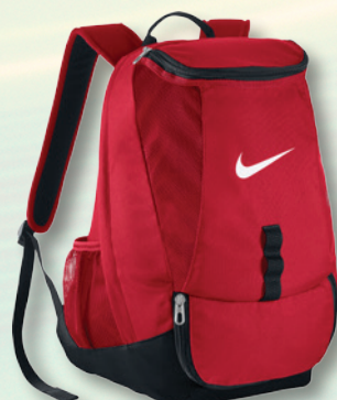
657 University Red/Black (White)

Life-cycle: 01 July 2015 - 31 March 2019