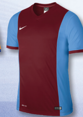
677 Team Red/University Blue/ Team Red/(White)