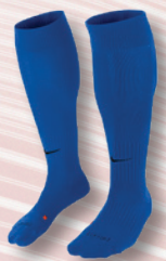
464 Royal Blue/ (Black)