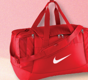
657 University Red/University Red/(White)