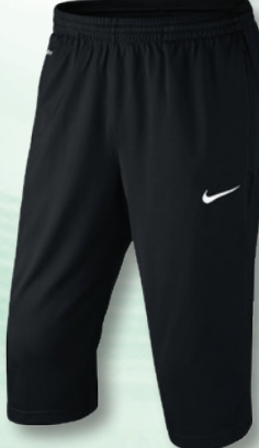
LIBERO 3/4 KNIT PANT p.52