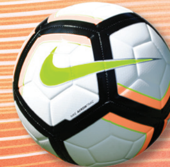
101 White/Total Orange/Black/(Volt)