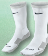
TEAM MATCHFIT CORE CREW SOCK p.54