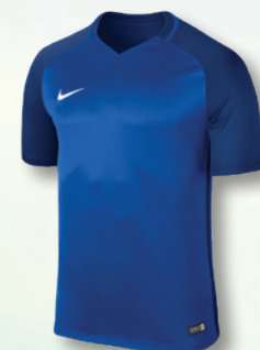
463 Royal Blue/Deep Royal Blue/ Deep Royal Blue/(White)