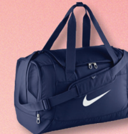
410 Midnight Navy/Midnight Navy/(White)