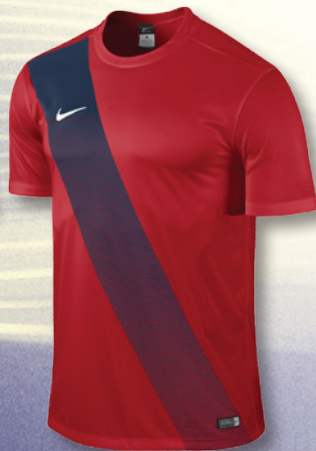
657 University Red/Midnight Navy/ (Football White)