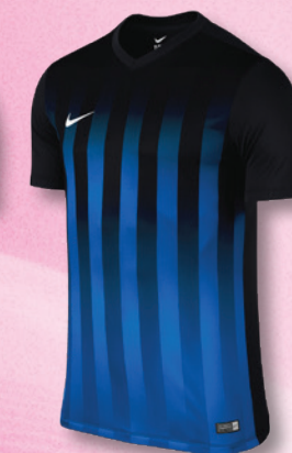
011 Black/Royal Blue/ (White)