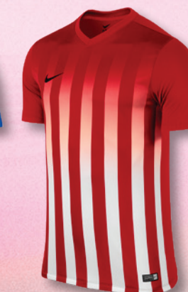
657 University Red/White/ (Black)