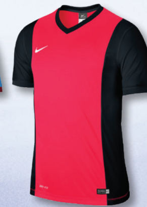
692 Solar Red/Black/Black/ (White)