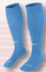
412 University Blue/ (White)