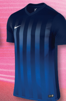
410 Midnight Navy/Royal Blue/ (White)