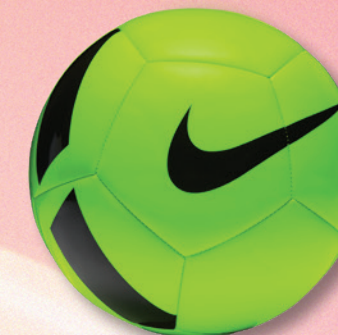
336 Electric Green/(Black)