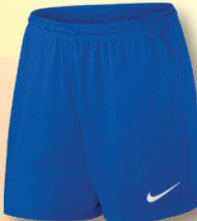
480 Royal Blue/ (White)