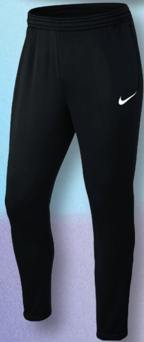
TECH PANT p.41