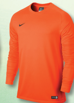
803 Total Orange/(Black)