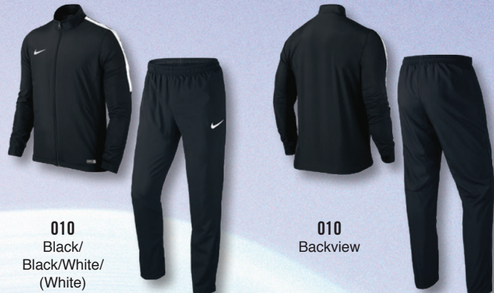
010 Black/ Black/White/ (White)

Life-cycle: 01 April 2016 - 31 March 2019