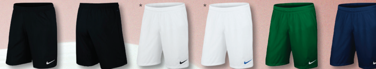
010 Black/ (White)

Life-cycle: 01 April 2016 - 31 March 2019