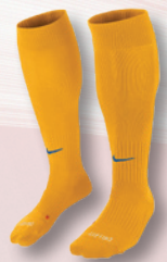
740 University Gold/ (Royal Blue)