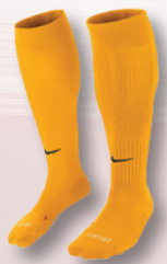
739 University Gold/ (Black)