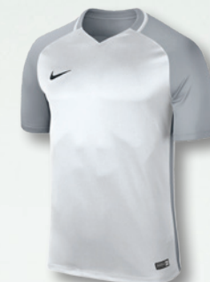
100 White/Wolf Grey/ Wolf Grey/(Black)