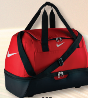
657 University Red/Black/(White)