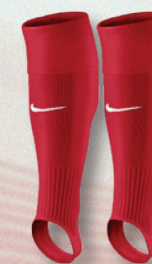
657 University Red/ (White)