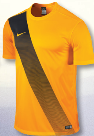
739 University Gold/Black/ (University Gold)