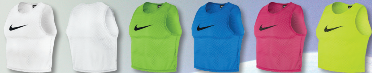
100 White/(Black) 100 Backview 313 Action Green/(Black) 406 Photo Blue/(Black) 616 Vivid Pink/(Black) 702 Volt/(Black)