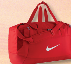
657 University Red/University Red/(White)