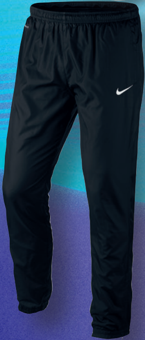
LIBERO WOVEN CUFFED PANT p.53