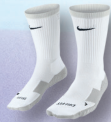
TEAM MATCHFIT CORE CREW SOCK p.54