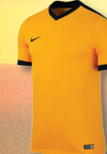
739 University Gold/University Gold/ Black/(Black)