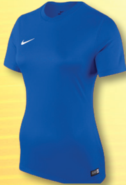
480 Royal Blue/(White)