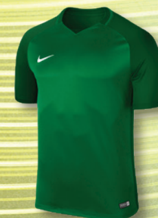
302 Pine Green/Gorge Green/ Gorge Green/(White)