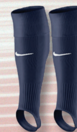
410 Midnight Navy/ (White)