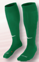
302 Pine Green/ (White)