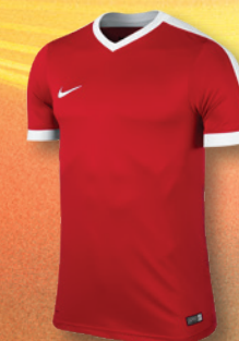
657 University Red/ University Red/White/(White)