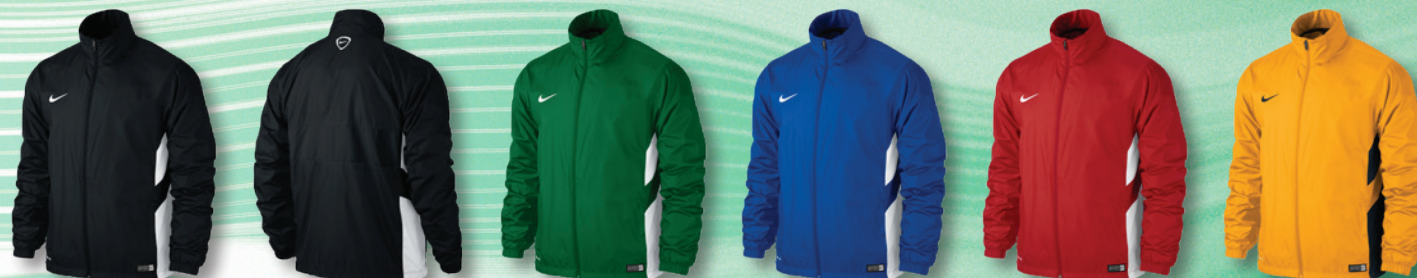
010 Black/White/(White) 010 Backview 302 Pine Green/White/(White) 463 Royal Blue/White/(White) 657 University Red/White/(White) 739 University Gold/Black/(Black)

Life-cycle: 01 April 2014 - 31 March 2018