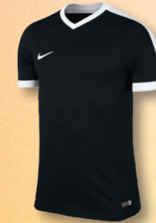
010 Black/Black/ White/(White)

Life-cycle: 01 April 2016 - 31 March 2019