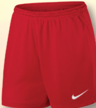
657 University Red/ (White)