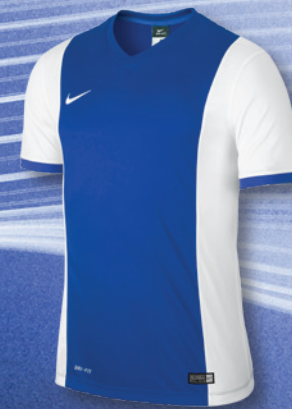
463 Royal Blue/White/Royal Blue/ (White)