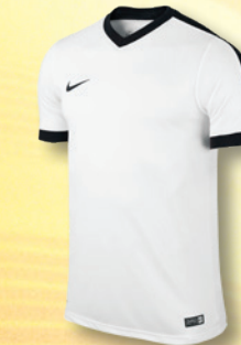
103 White/White/ Black/(Black)