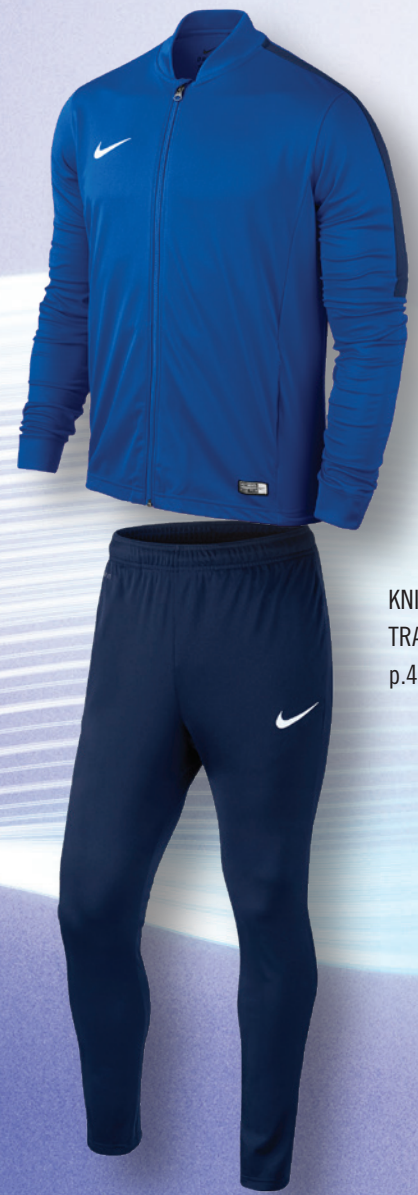
KNIT TRACKSUIT p.42