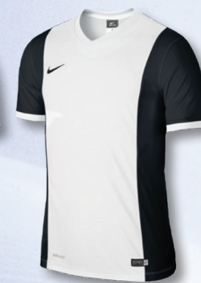
100 White/Black/White/ (Black)