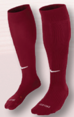
670 Team Red/ (White)