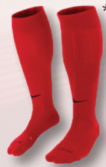
657 University Red/ (Black)