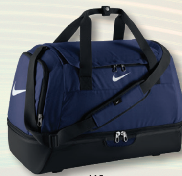
410 Midnight Navy/Black/(White)