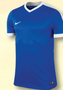
463 Royal Blue/Royal Blue/ White/(White)