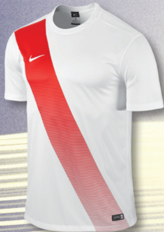
105 Football White/University Red/ (Football White)

Life-cycle: 01 April 2015 - 31 March 2018