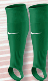
302 Pine Green/(White)