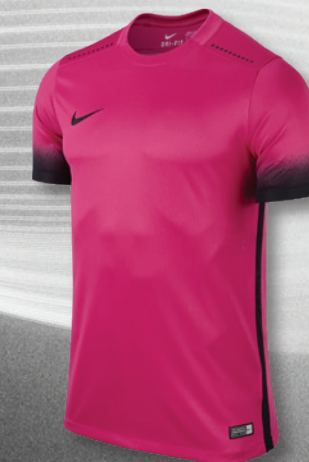
616 Vivid Pink/Black/(Black)