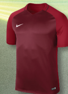
677 Team Red/Gym Red/ Gym Red/(White)