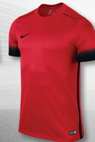
657 University Red/Black/(Black)