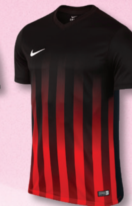
012 Black/University Red/ (White)