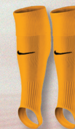
739 University Gold/ (Black)