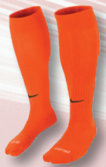
816 Safety Orange/ (Black)