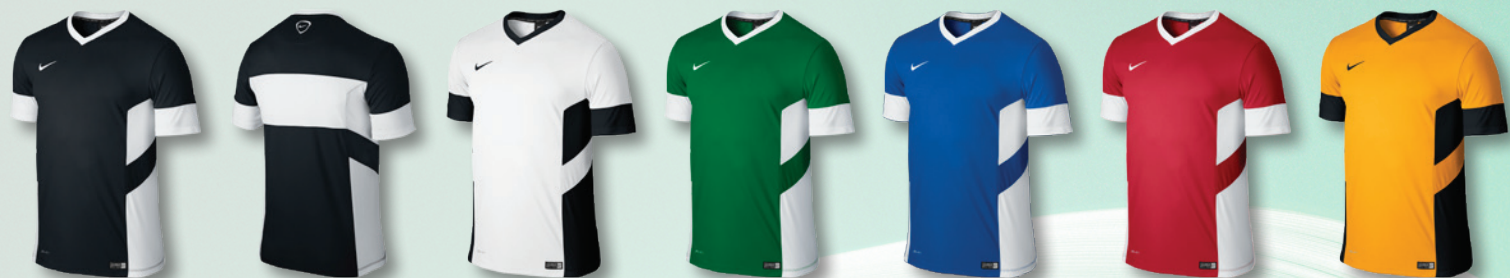
010 Black/White/(White) 010 Backview 100 White/Black/(Black) 302 Pine Green/White/(White) 463 Royal Blue/White/(White) 657 University Red/White/(White) 739 University Gold/Black/(Black)