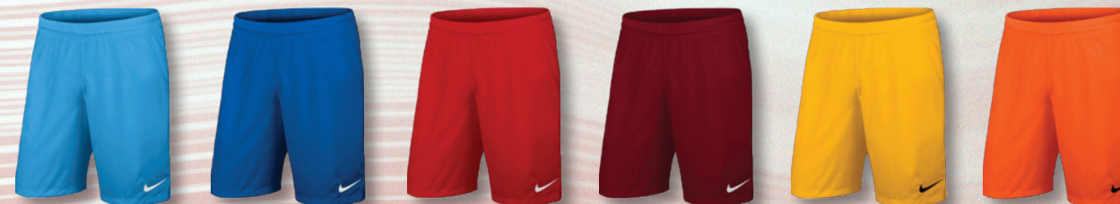
412 University Blue/ (White)