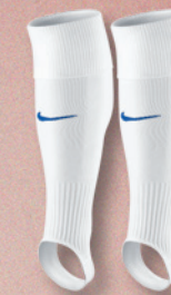
101 White/(Royal Blue)