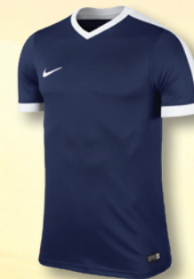
410 Midnight Navy/Midnight Navy/ White/(White)