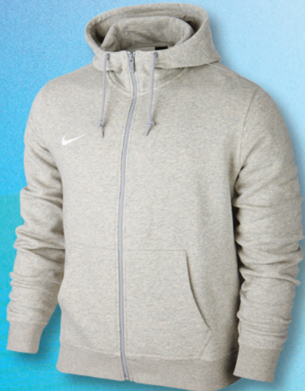
TEAM CLUB FULL-ZIP HOODY p.60