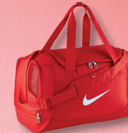
657 University Red/University Red/(White)