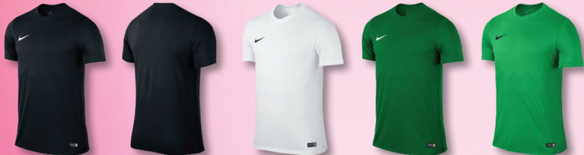
010 Black/(White) 010 Backview 100 White/(Black) 302 Pine Green/(White) 303 Hyper Verde/(Black)

Life-cycle: 01 April 2016 - 31 March 2020