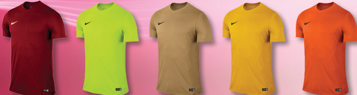
677 Team Red/(White) 702 Volt/(Black) 738 Jersey Gold/(Black) 739 University Gold/(Black) 815 Safety Orange/(Black)