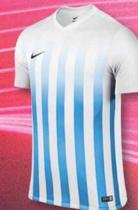
100 White/University Blue/ (Black)