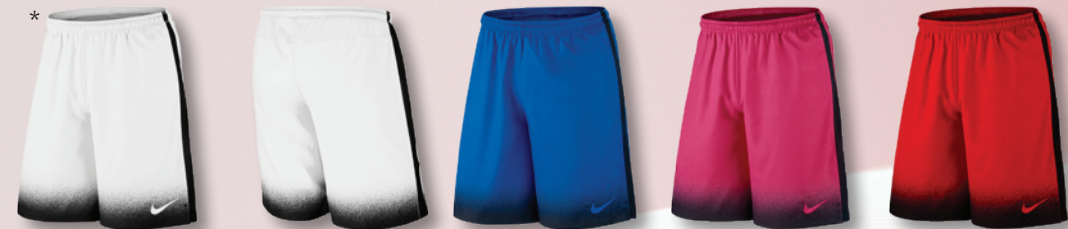
100 White/Black/ (White)