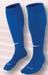
463 Royal Blue/ (White)