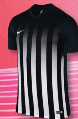
010 Black/White/ (White)

Life-cycle: 01 April 2016 - 31 March 2018