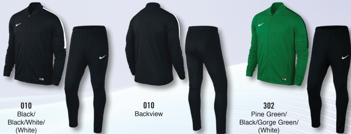
010 Black/ Black/White/ (White)