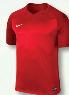
657 University Red/Gym Red/ Gym Red/(White)