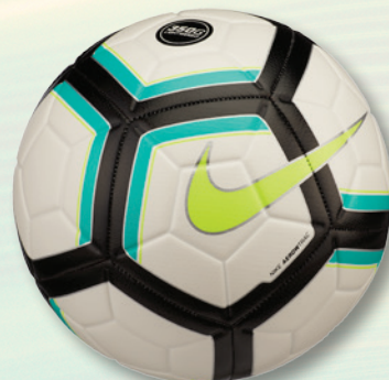
SC3126 - 100 White/Clear Jade/Black/(Volt)