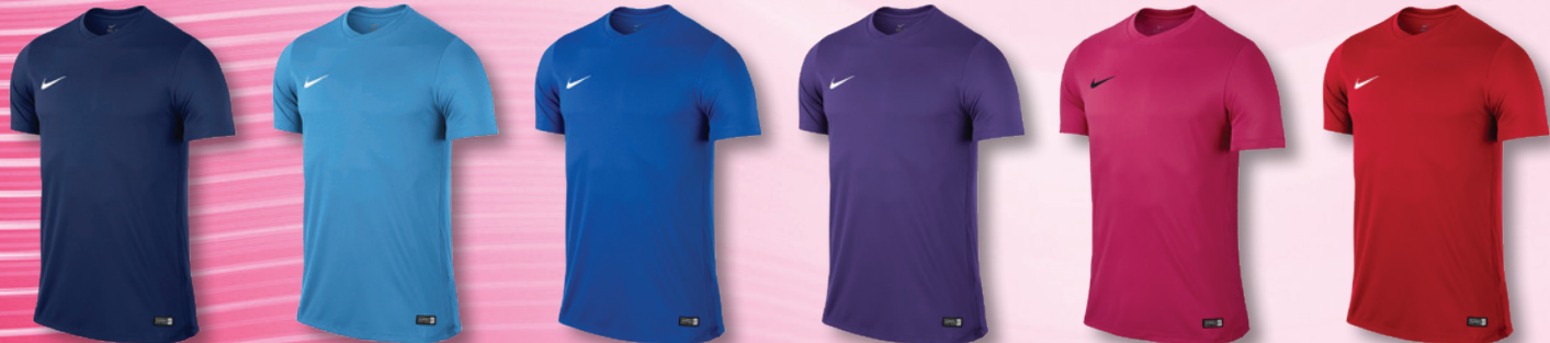
410 Midnight Navy/(White) 412 University Blue/(White) 463 Royal Blue/(White) 547 Court Purple/(White) 616 Vivid Pink/(Black) 657 University Red/(White)