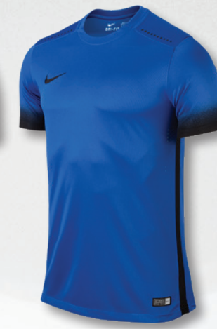
463 Royal Blue/Black/(Black)