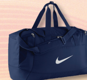
410 Midnight Navy/Midnight Navy/(White)