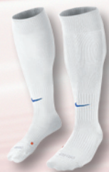
101 White/ (Royal Blue)