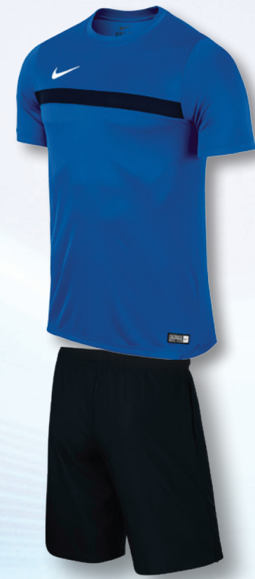
TRAINING TOP p.40