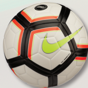
SC3127 - 100 White/Tot Crim/Black/(Volt)