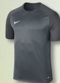
065 Cool Grey/Dark Grey/ Dark Grey/(White)