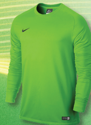
303 Electric Green/(Black)