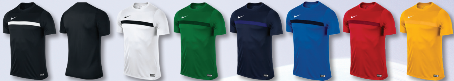
010 010 100 302 451 463 657 739 Black/White/ (White) Backview White/Black/ (Black) Pine Green/Gorge Green/(White) Obsidian/Deep Royal Blue/(White) Royal Blue/ Obsidian/(White) University Red/ Gym Red/(White) University Gold/ Varsity Maize/(White)