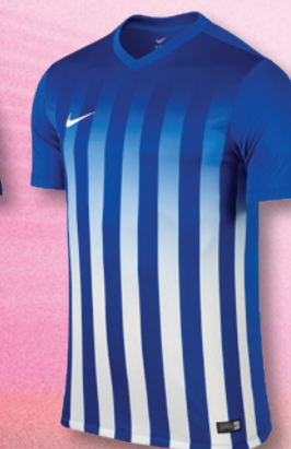
463 Royal Blue/White/ (White)