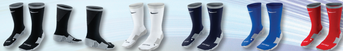
010 Black/Anthracite/(White) 010 Backview 100 White/Jetstream/(Black) 451 Obsidian/Deep Royal/(White) 463 Royal Blue/Bright Blue/(White) 657 University Red/Team Red/(White)

Life-cycle: 01 April 2017 - 31 March 2020