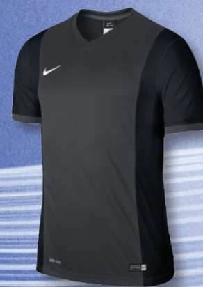
060 Anthracite/Black/Anthracite/ (White)

Life-cycle: 01 April 2014 - 31 March 2018