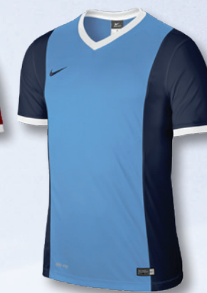
412 University Blue/Midnight Navy/ White/(Midnight Navy)