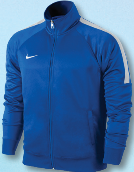
TEAM CLUB TRAINER JACKET p.59