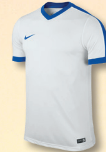
100 White/White/Royal Blue/ (Royal Blue)