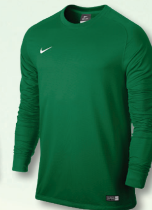
302 Pine Green/(White)