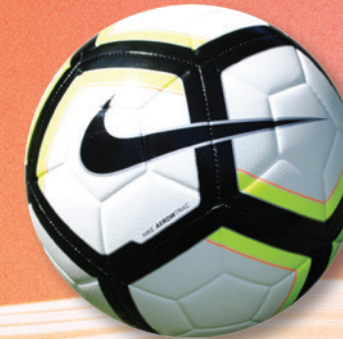
100 White/Bright Citrus/(Black)

MODERN CONSTRUCTION. ENHANCED DURABILITY AND TOUCH.