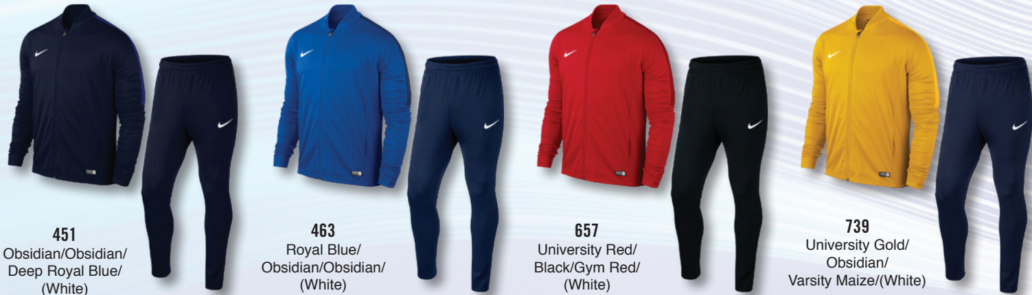
451 Obsidian/Obsidian/ Deep Royal Blue/ (White)