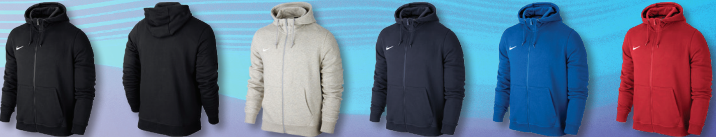
010 Black/Black/(Football White)

658499 Youth XS S M L XL RRP £ 29,95 RRP £ 35,95