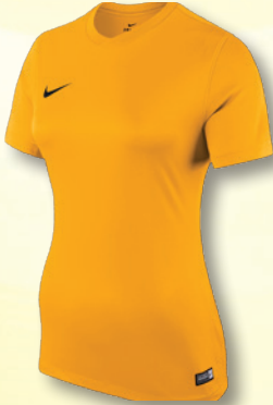
739 University Gold/(Black)