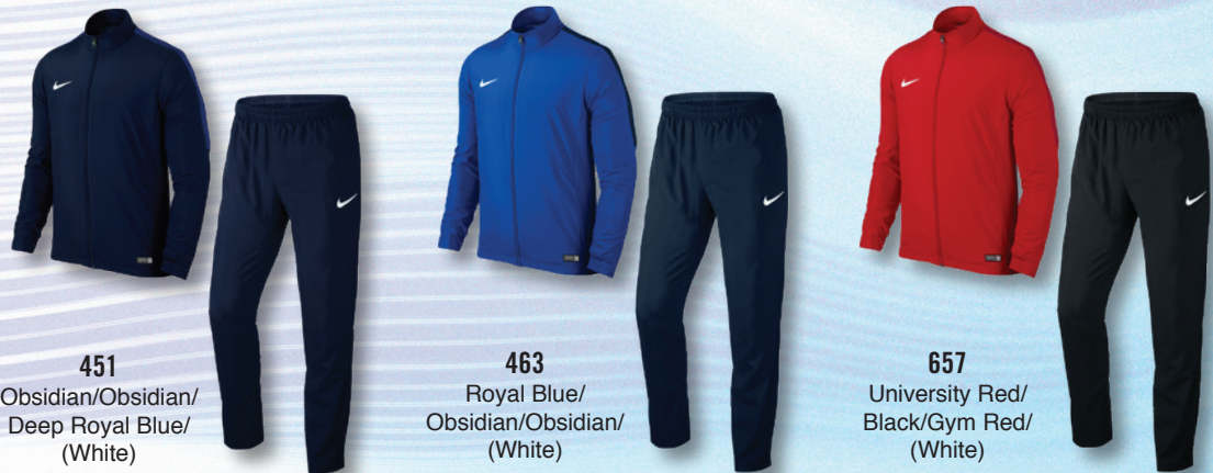
451 Obsidian/Obsidian/ Deep Royal Blue/ (White)