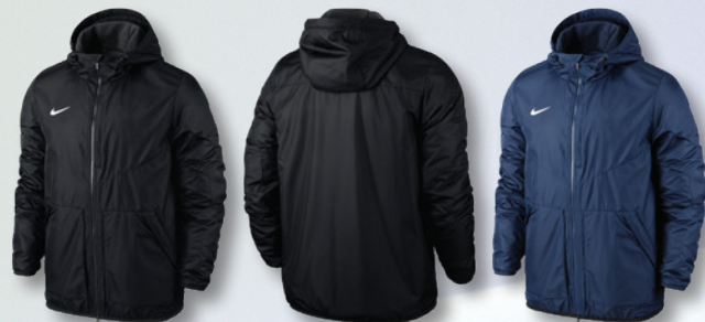
010 Black/Anthracite/ (White)