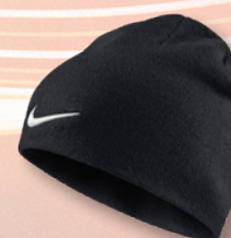
010 Black/ (Football White)

Life-cycle: 01 July 2015 - 31 March 2019