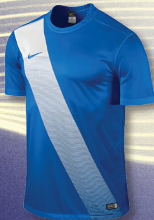
463 Royal Blue/Football White/ (Royal Blue)