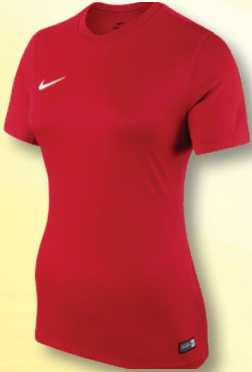
657 University Red/(White)