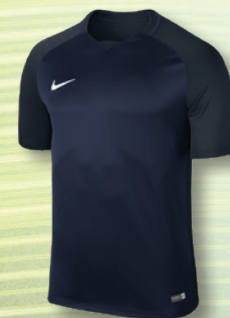
410 Midnight Navy/Dark Obsidian/ Dark Obsidian/(White)