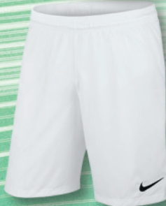
LASER WOVEN III SHORT p.25