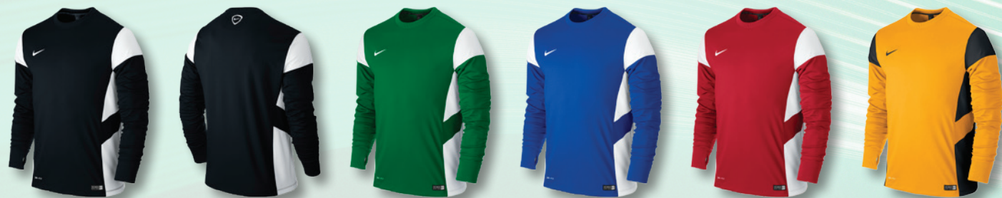
010 Black/White/(White) 010 Backview 302 Pine Green/White/(White) 463 Royal Blue/White/(White) 657 University Red/White/(White) 739 University Gold/Black/(Black)

Life-cycle: 01 April 2014 - 31 March 2018