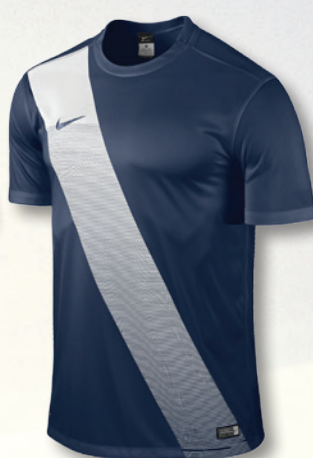
410 Midnight Navy/Football White/ (Midnight Navy)