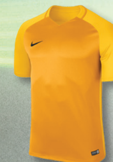
739 University Gold/Tour Yellow/ Tour Yellow/(Black)