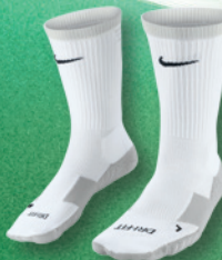
TEAM MATCHFIT CORE CREW SOCK p.54