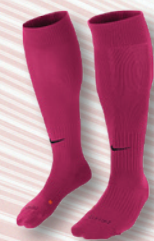
616 Vivid Pink/ (Black)