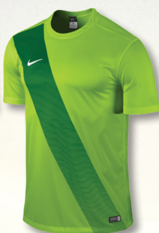
313 Action Green/Pine Green/ (Football White)